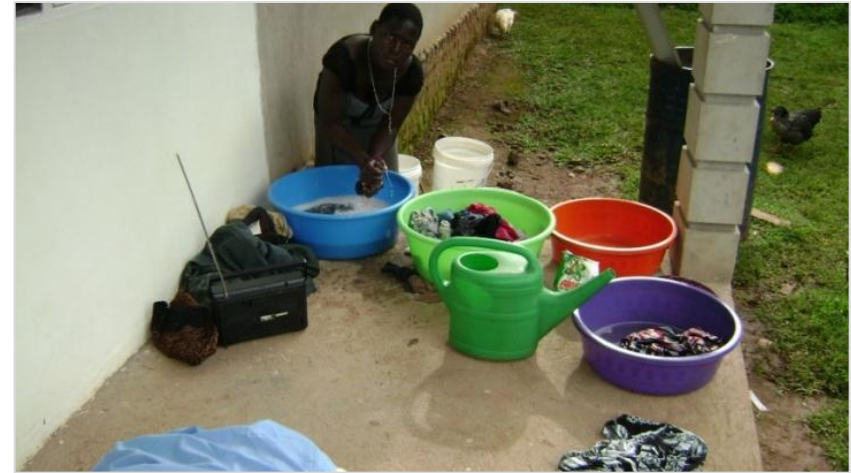
Washing and drying clothes at school