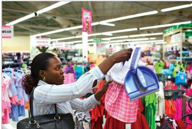
Shopping mall in Kampala